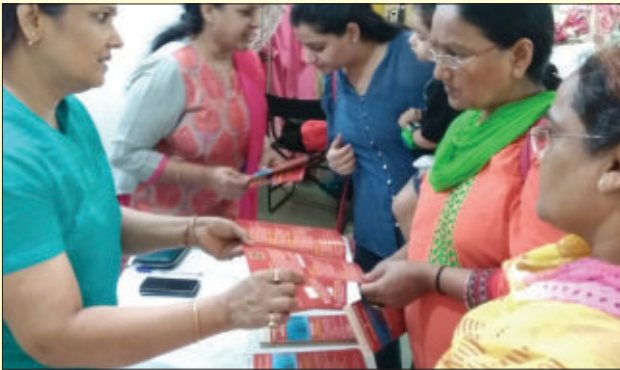
YPV Stall for two days was taken in Shubham Exhibition, Jaipur in July 2016. Another stall was also taken at Hotel Sarovar Portico, Jaipur in Oct .