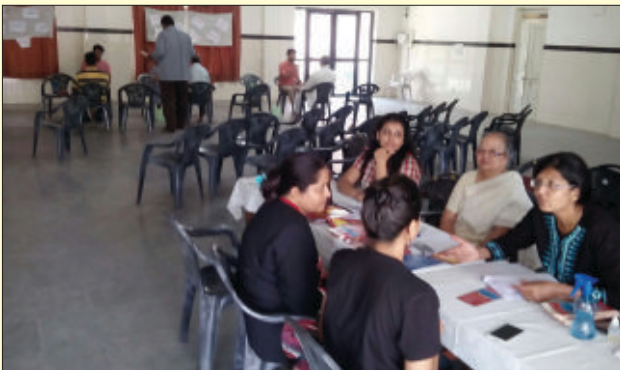
Free Healing Camp was organized on 18 th Sept, at the Community centre of Shyamnagar at Jaipur.