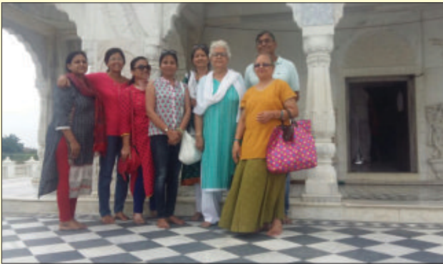
Participants from Rajasthan Foundation enroute to Bihar retreat