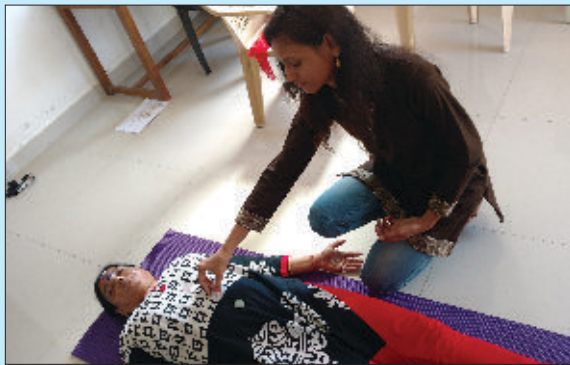
Free Healing Camp at "Nirvana", Foundation on 27 Nov 2016