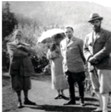
The Roerich Family

"But these were the challenges [Roerich] felt born for.