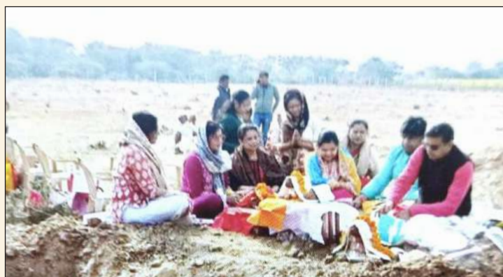
Bhoomi Poojan for Maitri Homes at Agra Road