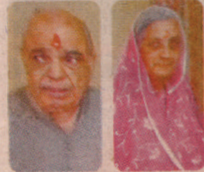
बुजुर्ग दम्पती का फाइल फोटो

यों परिवारों में लंबी उम्र के बुजुर्गों को पूरे कुनवे का सौभाग्य माना जाता है। लेकिन 40 लाख से अधिक आबादी का हमारा शहर एकाकी बुजुर्गों और बुजुर्ग दम्पतियों के लिए 'सुनसान' हो गया है। 'बस्ती' के लोग यदि इनके नियमित हालचाल लेते रहें तो इन घटनाओं पर लगाम कसी जा सकती है।